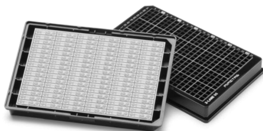
Supplementary Fig. 1. Image of a 2-lane OrganoPlate (cat#9605-400-B, MIMETAS)