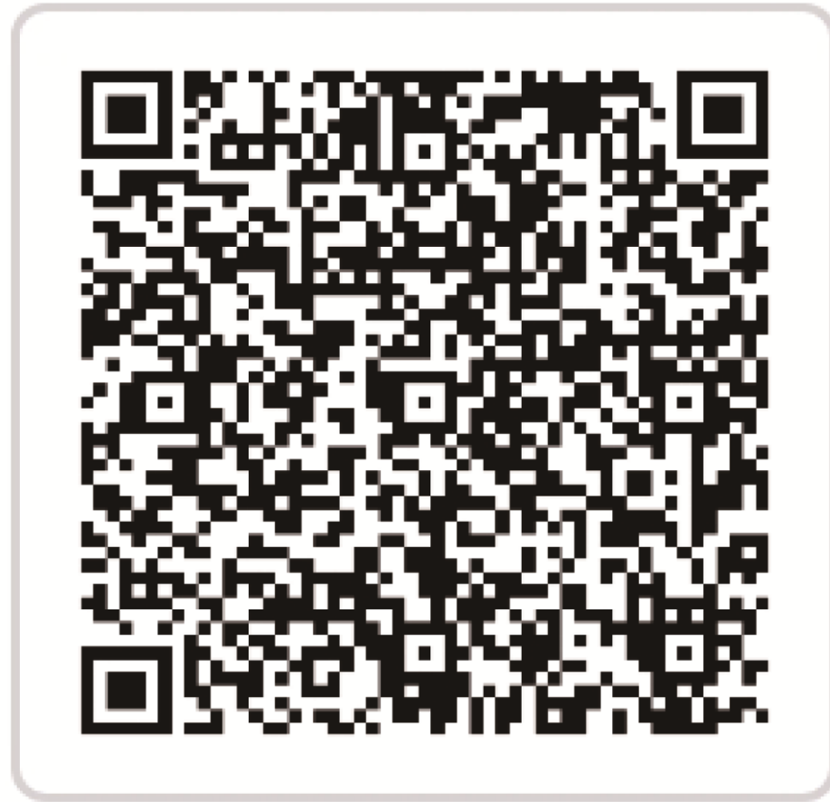
FigureS2. the QR code link of the model for easy access to it. This is to facilitate the usage of the PJ infection vs colonization model.